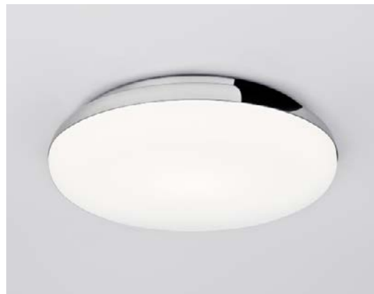
CODE: 1133002 (0586) FINISH: POLISHED CHROME

TO MAINTAIN THIS PRODUCT TO ITS BEST CONDITION, PLEASE VIEW OUR CARE AND CLEANING GUIDE ON THE SUPPORT SECTION OF THE ASTRO WEBSITE.